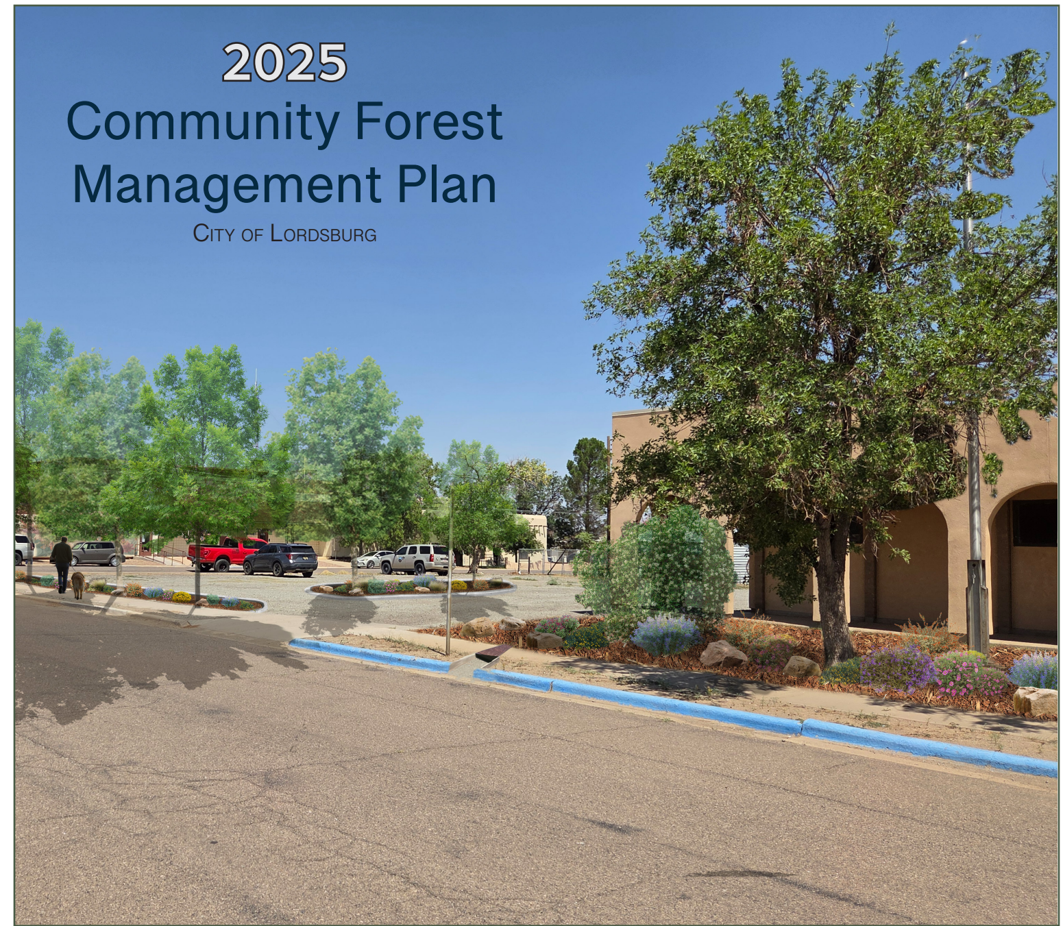
Rendering of E 4th Street and the Civic Center parking lot, imagining the streetscape transformed with healthy street trees, drought tolerant landscaping, and green stormwater infrastructure. Created by Anthropopolus Design and Planning.